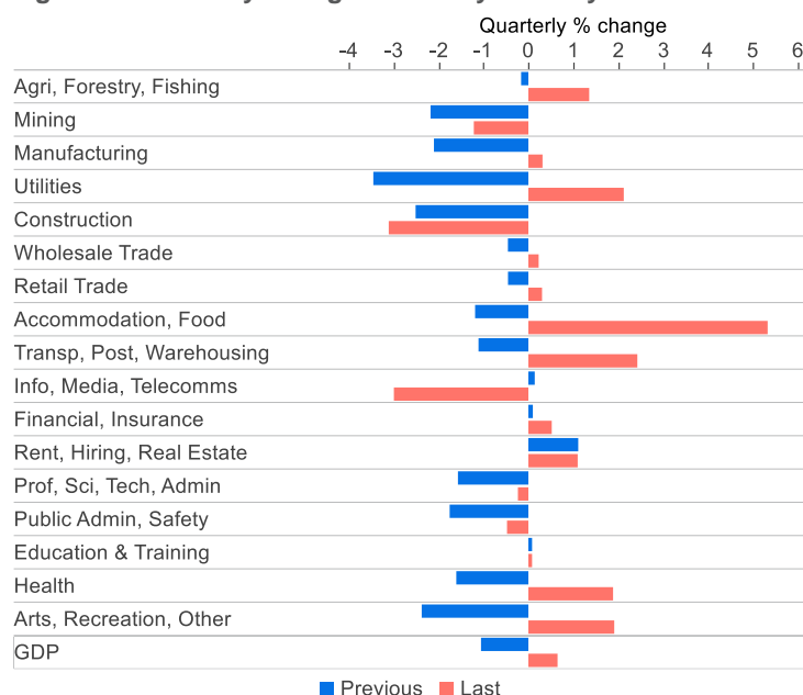
Figure 1. Quarterly change in GDP by industry